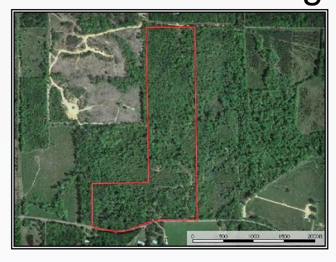
7091 King Road, Wesson

Attention Hunters and Do It Yourselfers!!! This is the place you have been looking for. This farm House is approximately 1,380 sq ft on 52 acres loaded with a 20+ year old natural regeneration pine and hardwood timber stand that is located on the edge of the Pearl River Basin in north east Copiah County, MS and has a recent timber appraisal of over $1,000 per acre. Being near the Pearl River Basin and having abundant mast producing trees, large and small game hunting is great. This property is near the Stronghope Community where quiet country living is at its best.