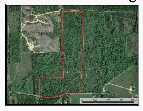
7091 King Road, Wesson

Attention Hunters and Do It Yourselfers!!! This is the place you have been looking for. This farm House is approximately 1,380 sq ft on 52 acres loaded with a 20+ year old natural regeneration pine and hardwood timber stand that is located on the edge of the Pearl River Basin in north east Copiah County, MS and has a recent timber appraisal of over $1,000 per acre. Being near the Pearl River Basin and having abundant mast producing trees, large and small game hunting is great. This property is near the Stronghope Community where quiet country living is at its best.