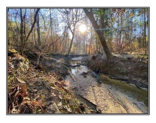
68± Acres MLS #140231