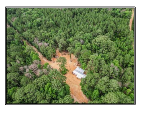
55± Acres MLS #141613