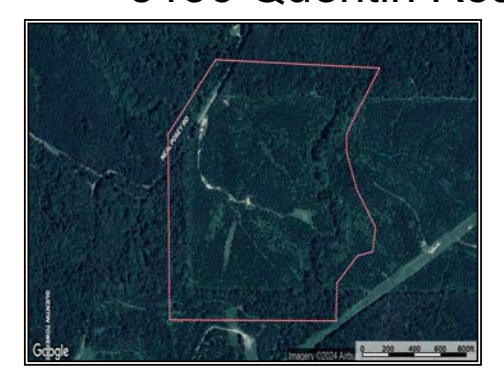
3136 Quentin Road, McCall Creek, MS

Hunting land for sale in Franklin County adjoining the Homochitto National Forest. Welcome to the Quentin Rd 42. This tract is 42.3 surveyed acres across the road from the Homochitto National Forest. The property is comprised mostly of planted pines providing great habitat for deer while the western border is comprised of the Homochitto National Forest. The property has all of the features that make a great hunting tract such as a great internal road system, big food plots, and great habitat. The property is also in a great surrounding area. With the additional acreage you can hunt on the National Forest, you never have to worry about running out of room for family and friends to hunt. There is already a campsite established with power available. Franklin County is known for being a great deer and turkey area, and this tract is no different. Properties connected to the Forest are rare to find, especially at price points and sizes like this. Give us a call today for more information and to schedule your private showing. Owner/Agent