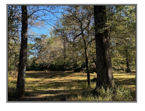
45.79± Acres MLS #143947