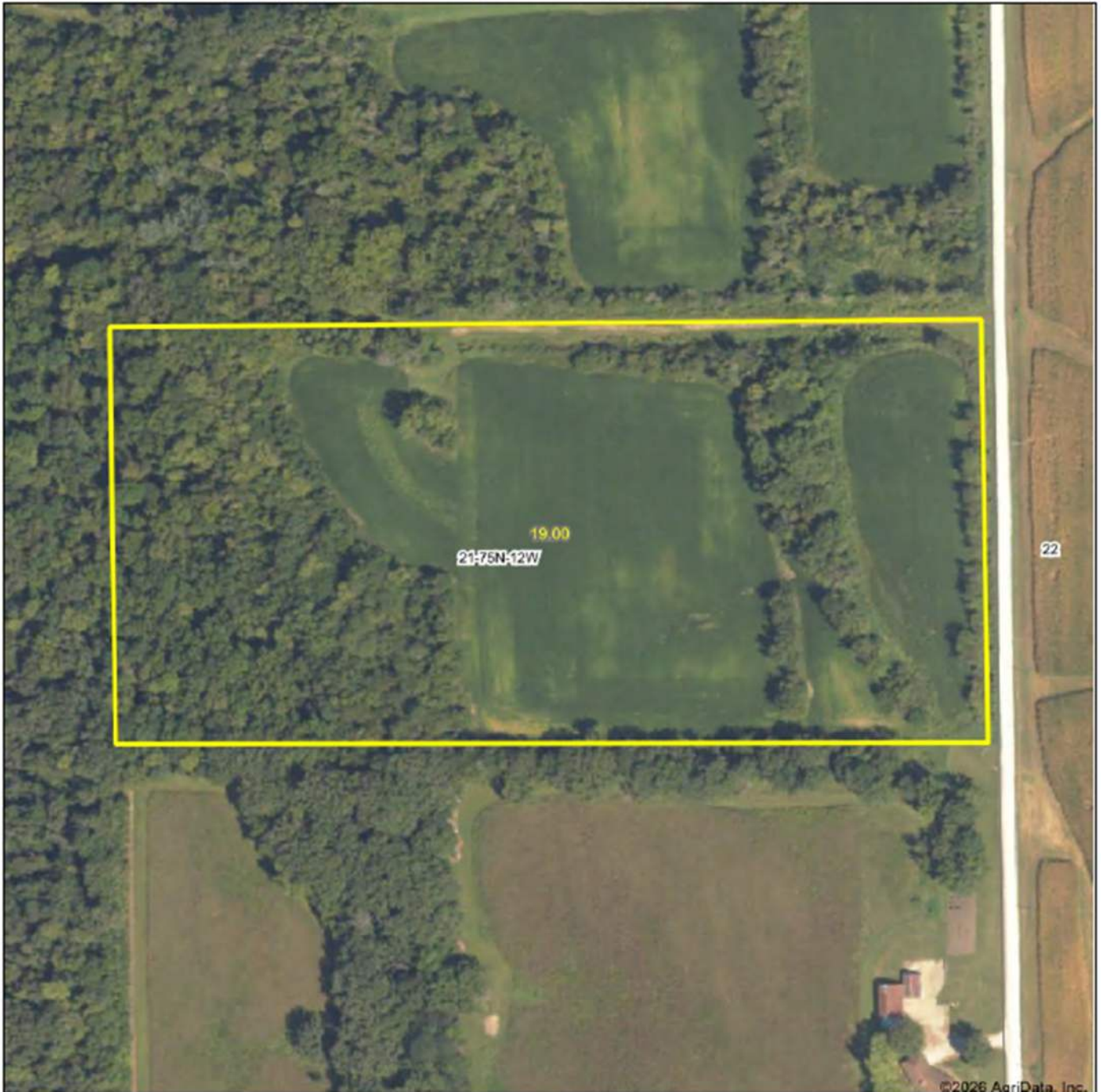
Aerial Map Boundary Lines Are Approximate